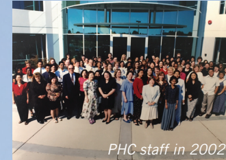
PHC staff in 2002

• Launches County Medical Services Program pilot that provided limited-term health coverage for uninsured low-income adults who were not otherwise eligible for other publicly funded health programs